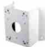
A35 Corner Mount