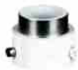
A37 Installation Adapter