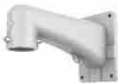
DF20Y Wall Mount