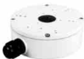
A22 JUNCTION BOX