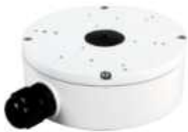
A22 JUNCTION BOX