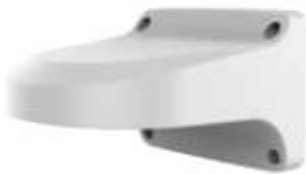
A29 A29 WALL MOUNT