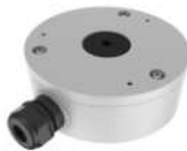
TC-P54BM SPEC: V5 JUNCTION BOX