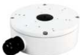
A22 JUNCTION BOX